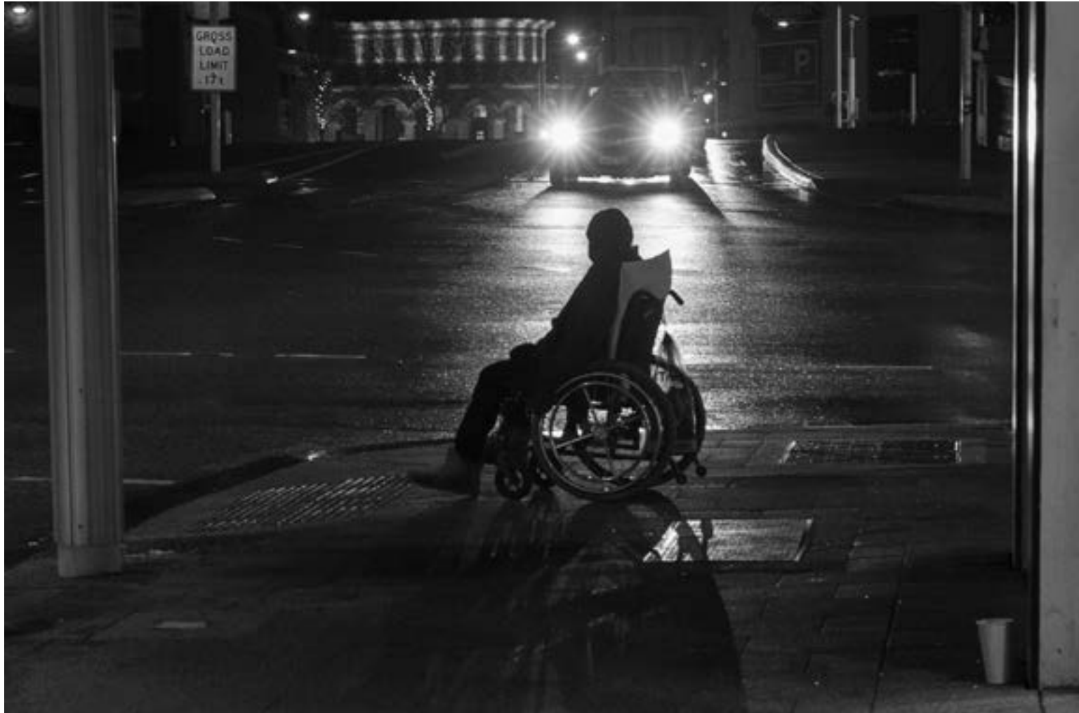
There are different ways to use an essential object