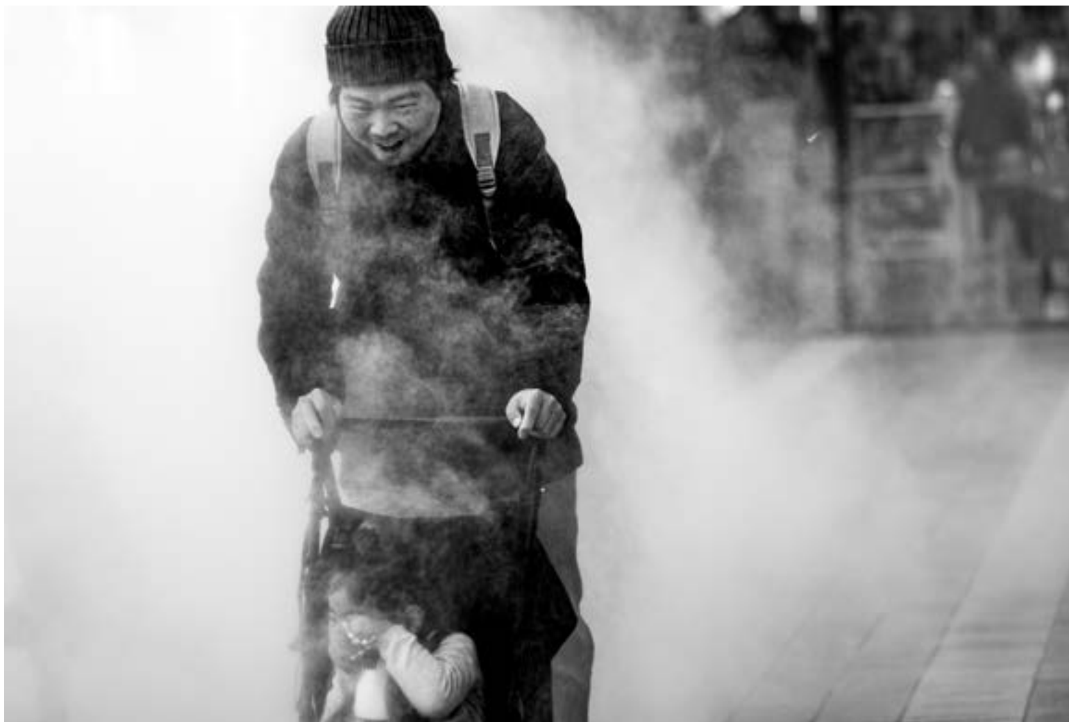
There are different ways of growing up