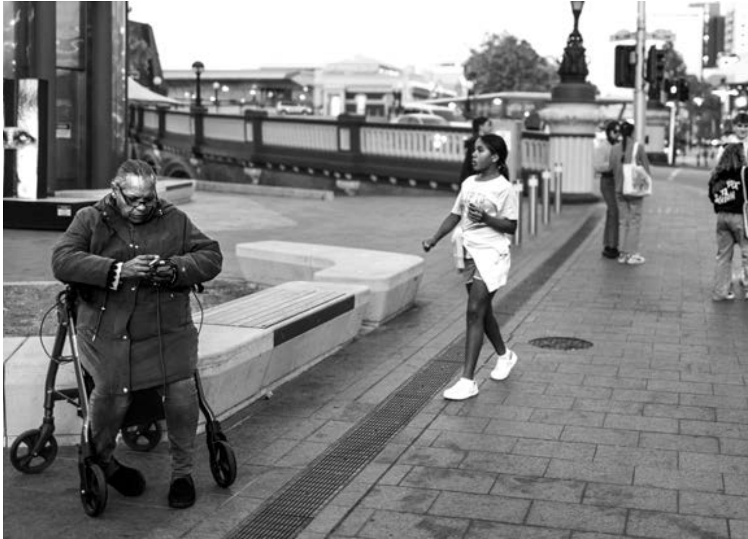
There are different ways of sharing moments