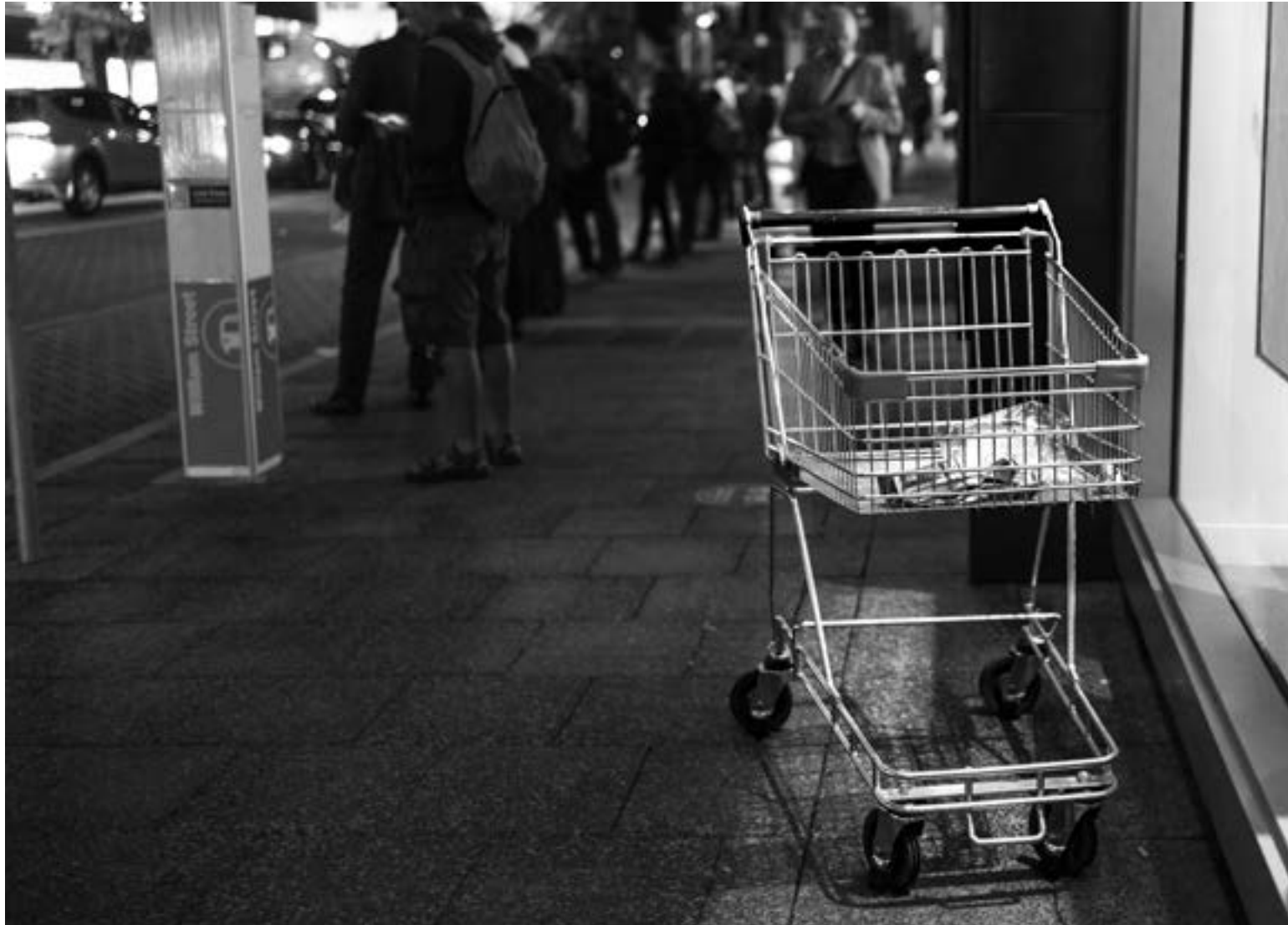
There are different ways to occupy an object