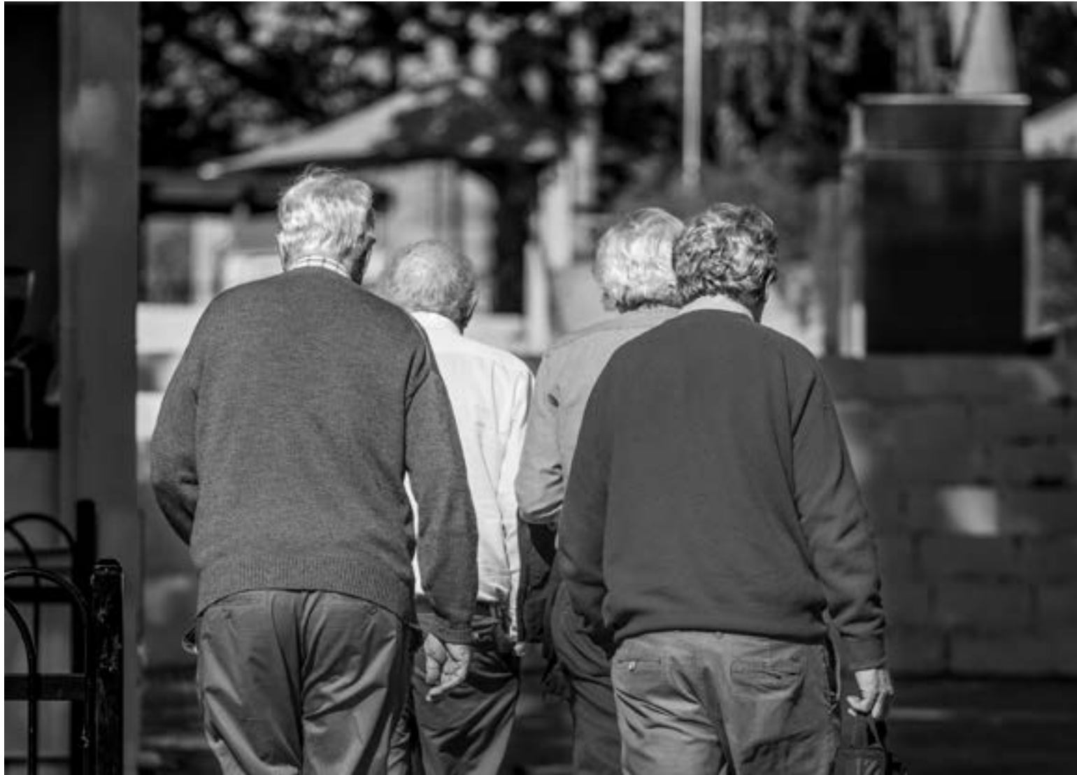
There are different ways of hanging out