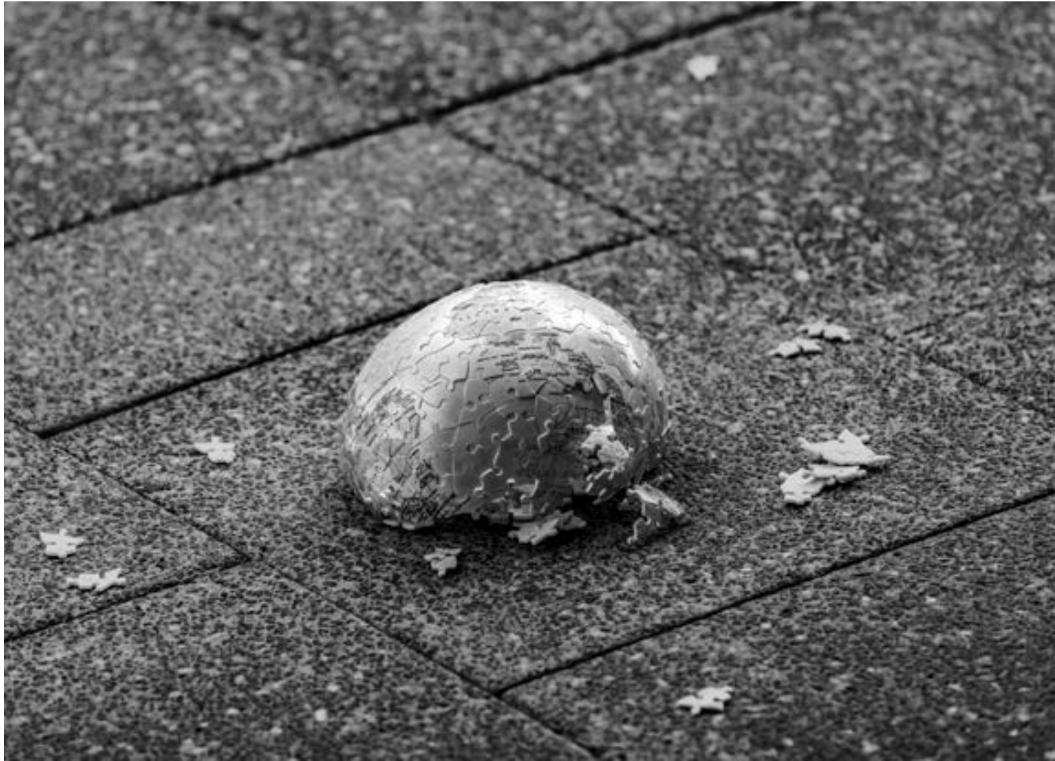
There are different ways of feeling love for our world