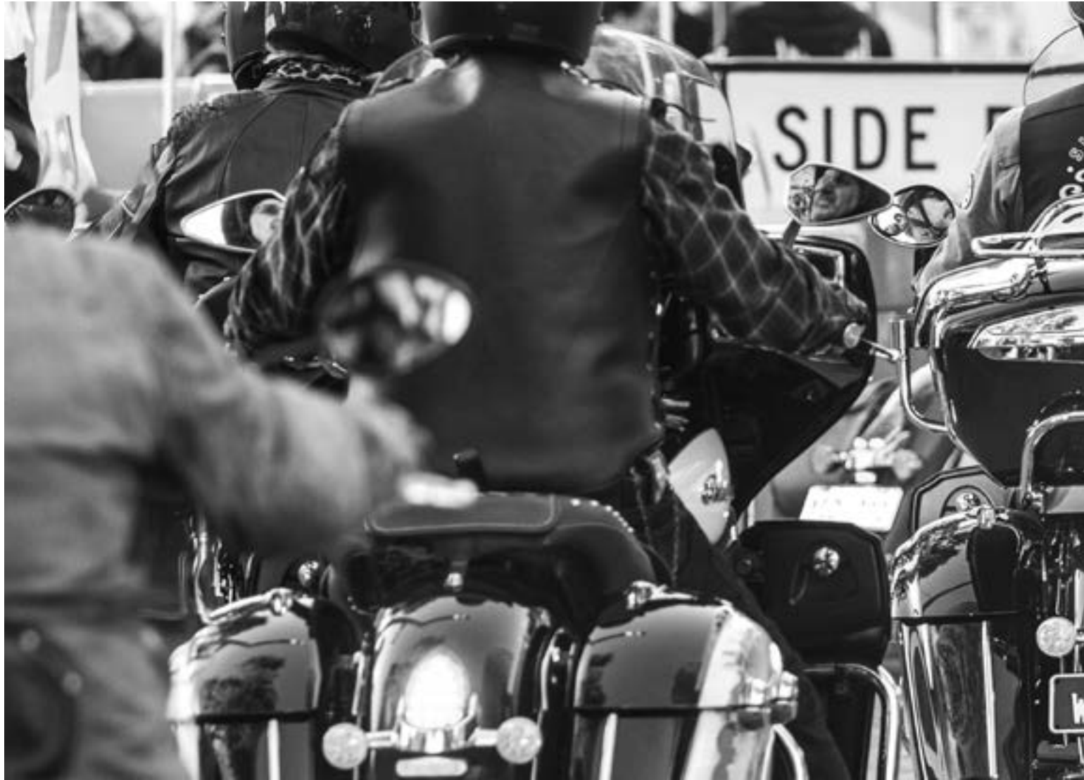
There are different ways of thinking