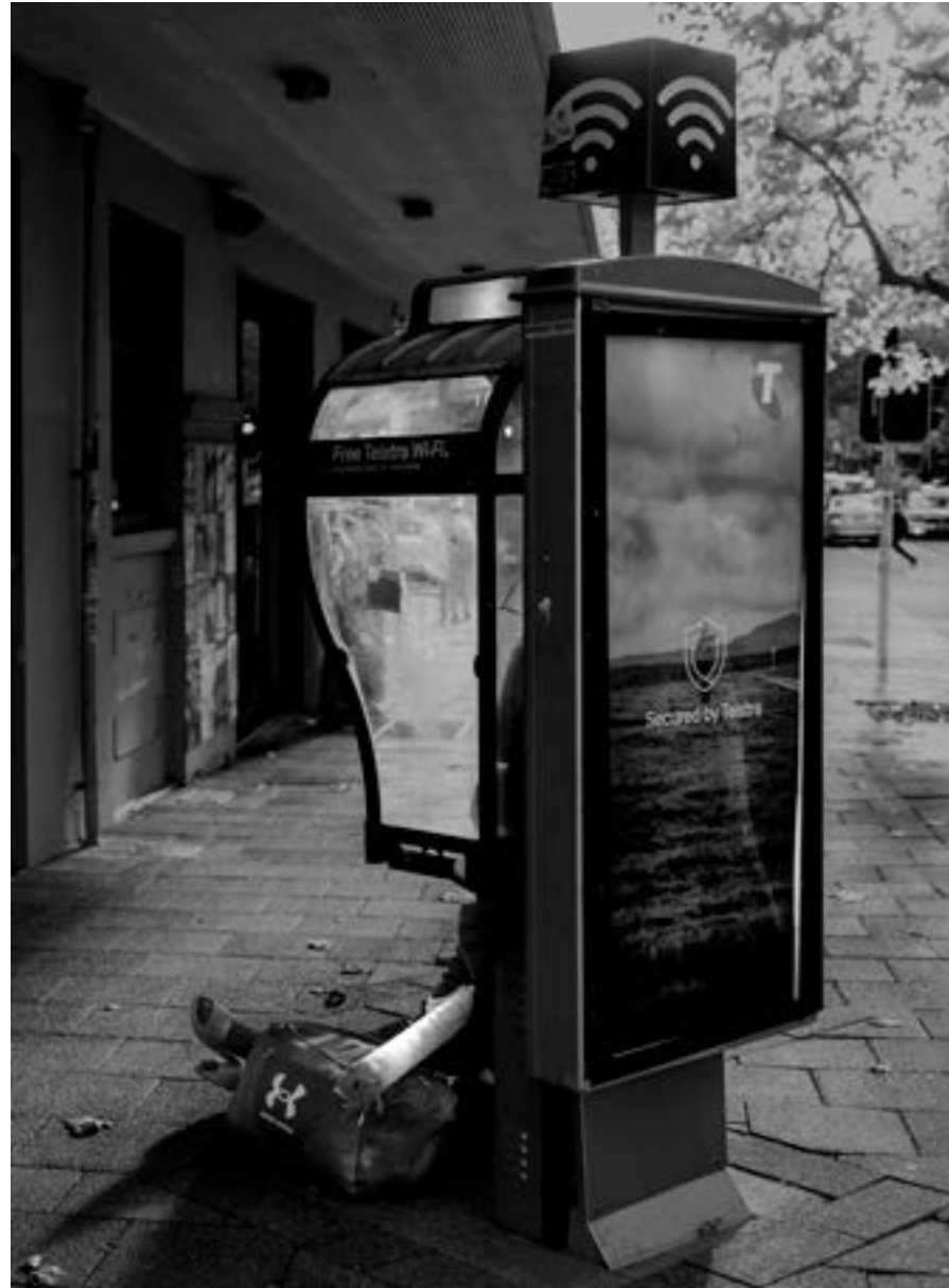
There are different ways of observing