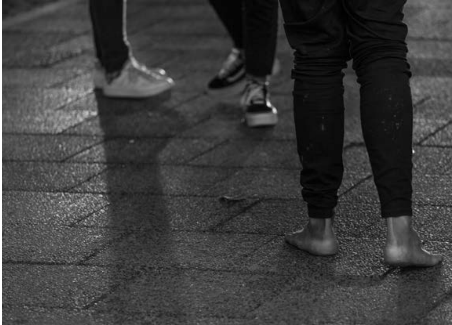
There are different ways to decide