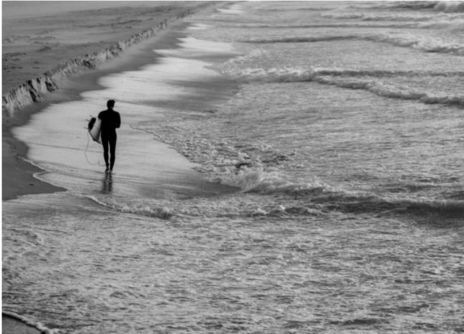
There are different ways to live our reality