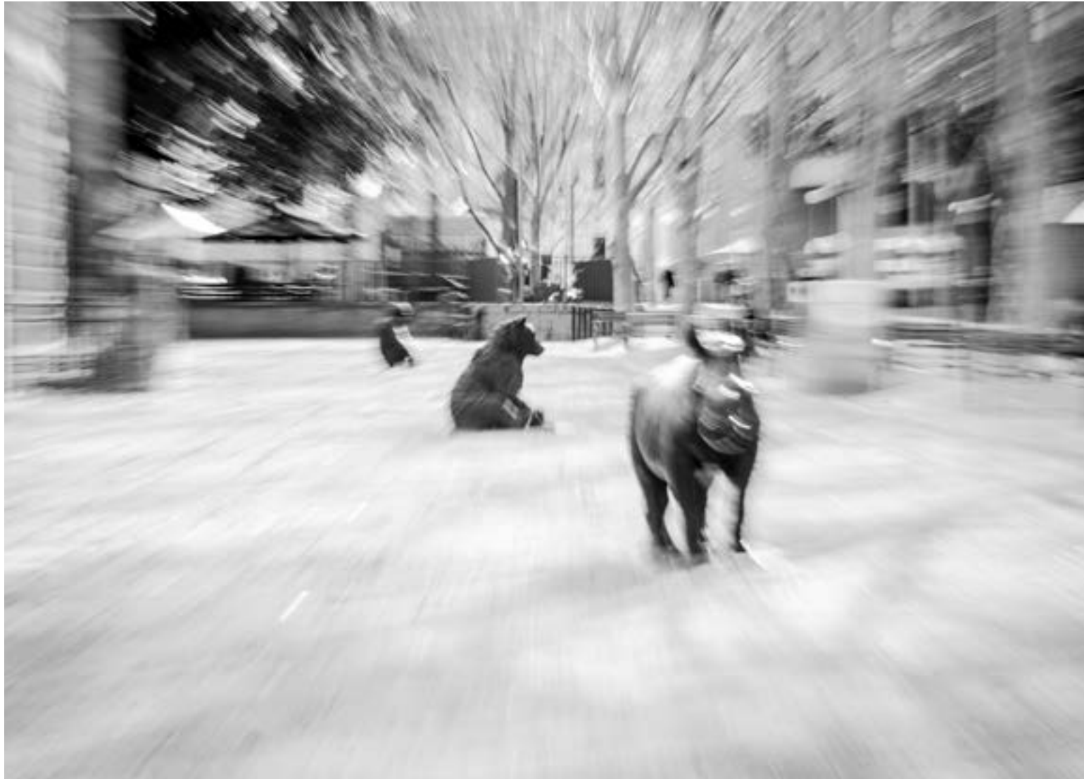
There are different ways to contemplate nature