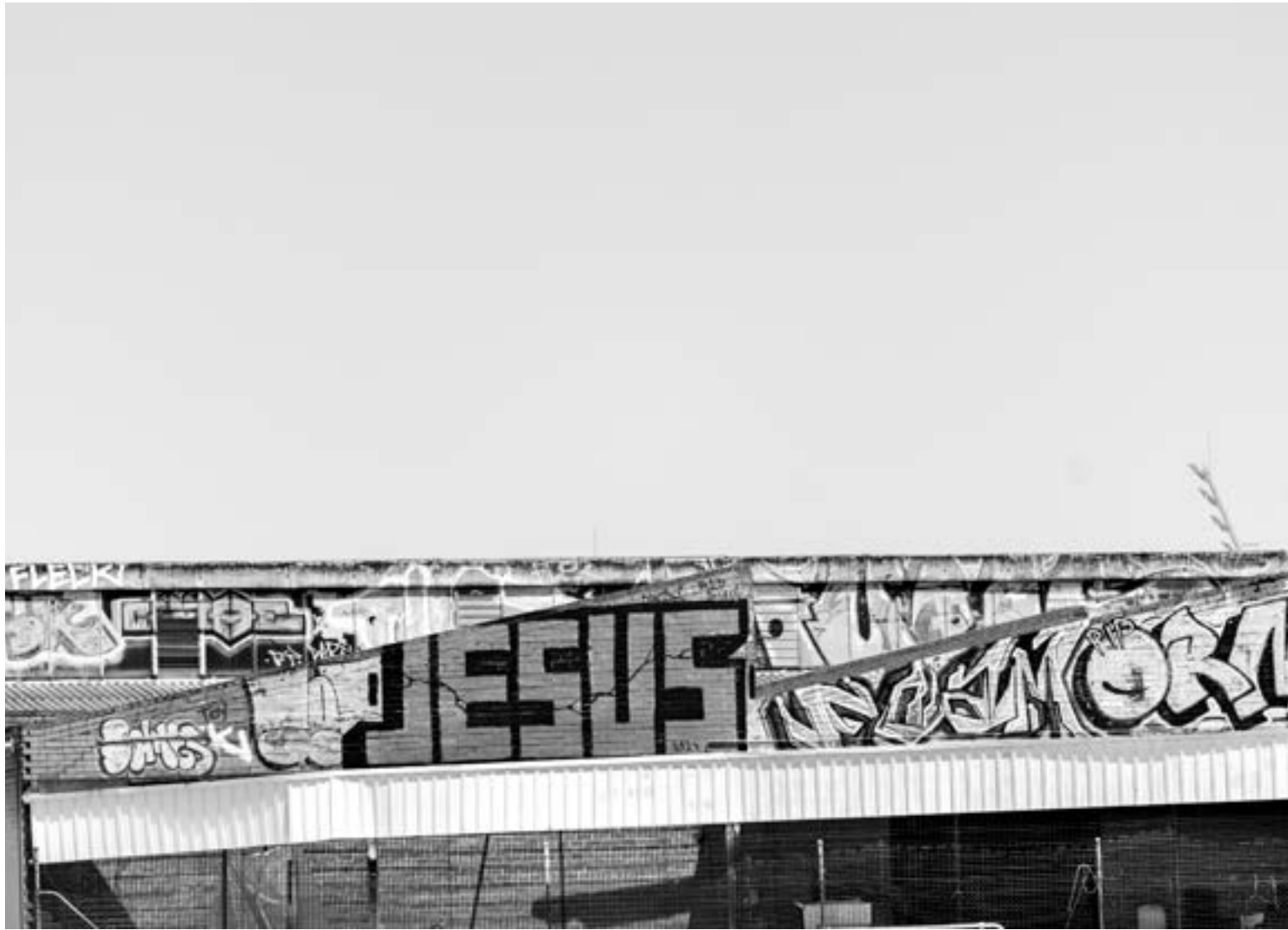
There are different ways of following stereotypes