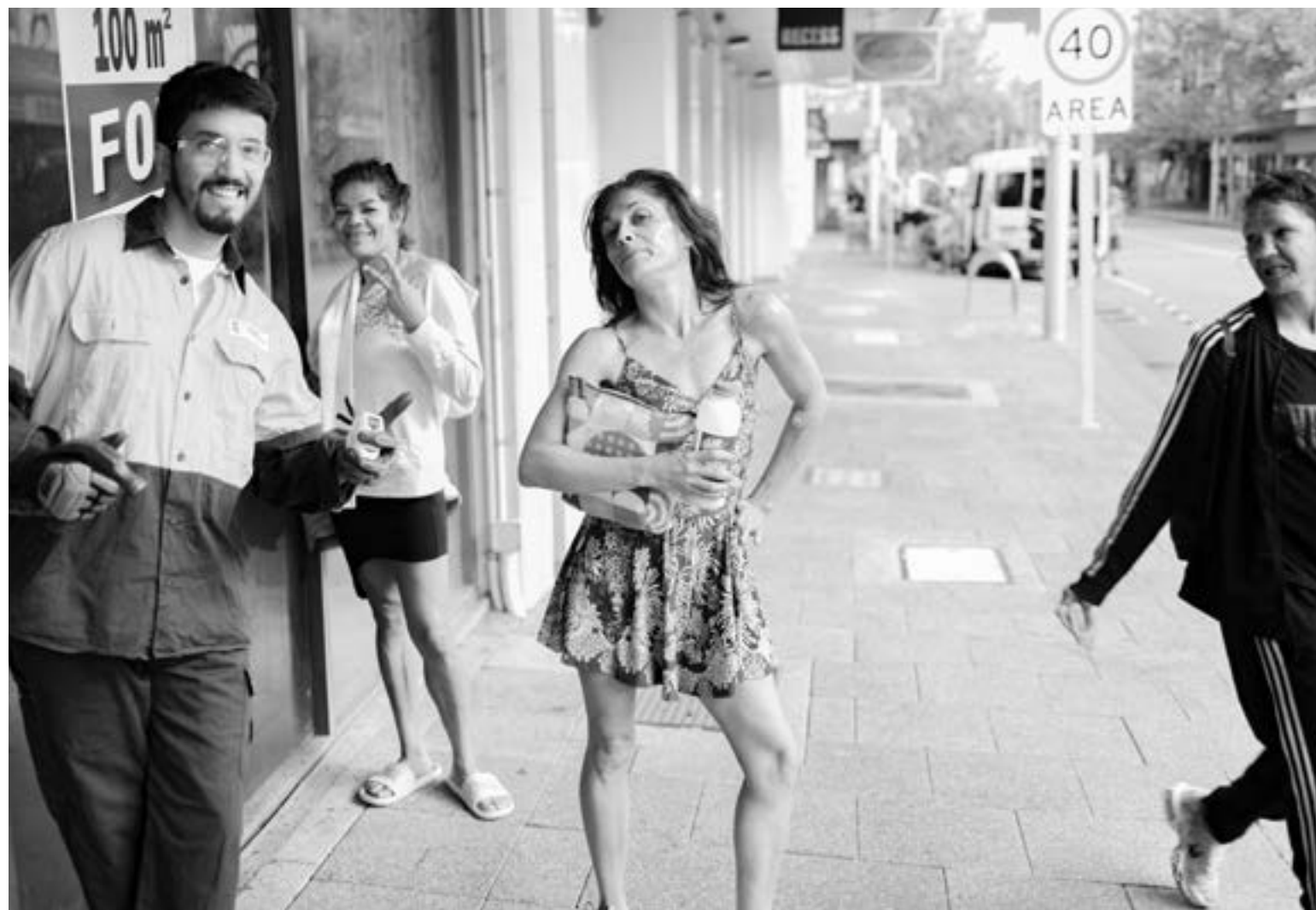
There are different ways to face a situation