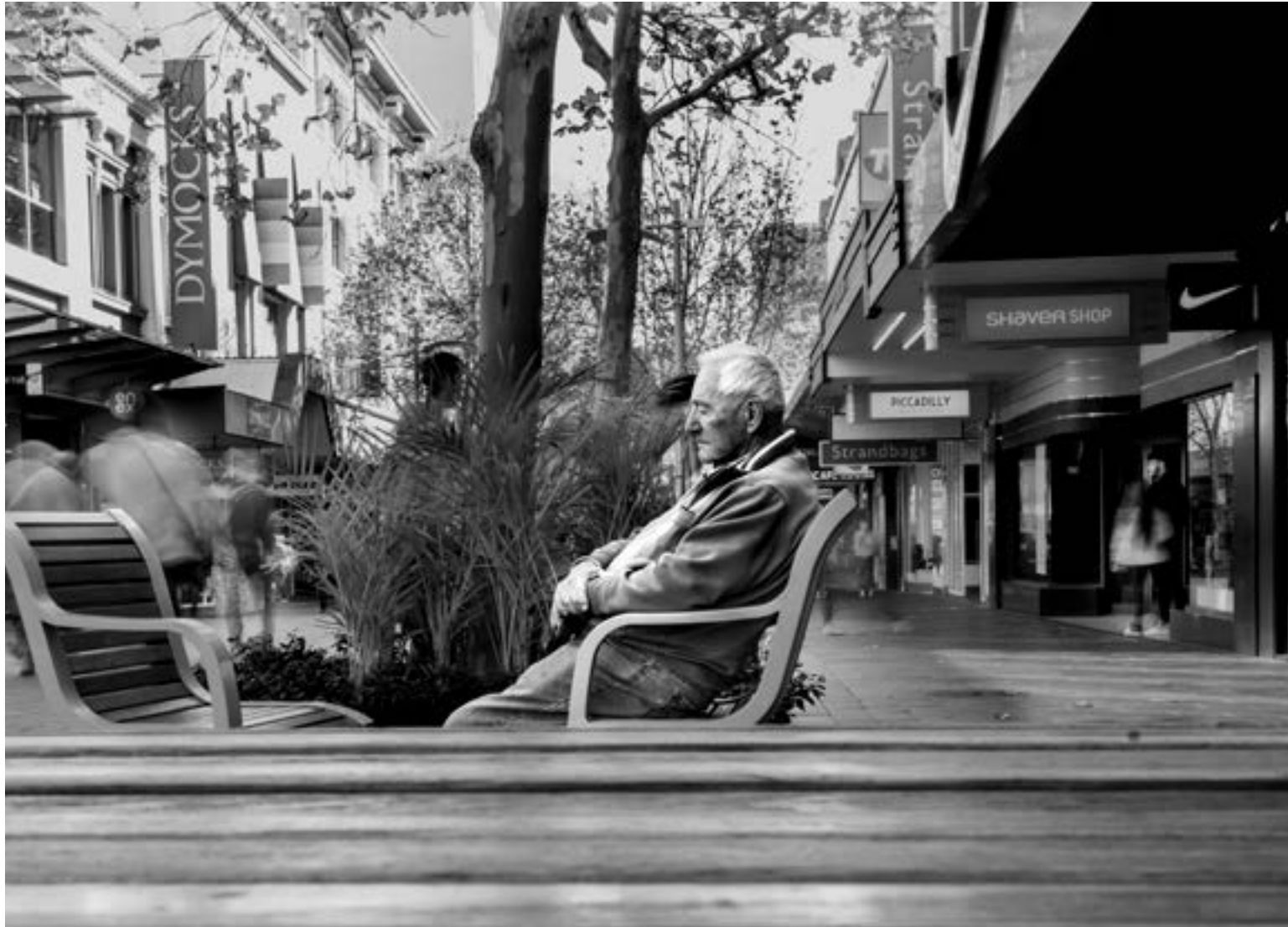
There are different ways to face the passage of time