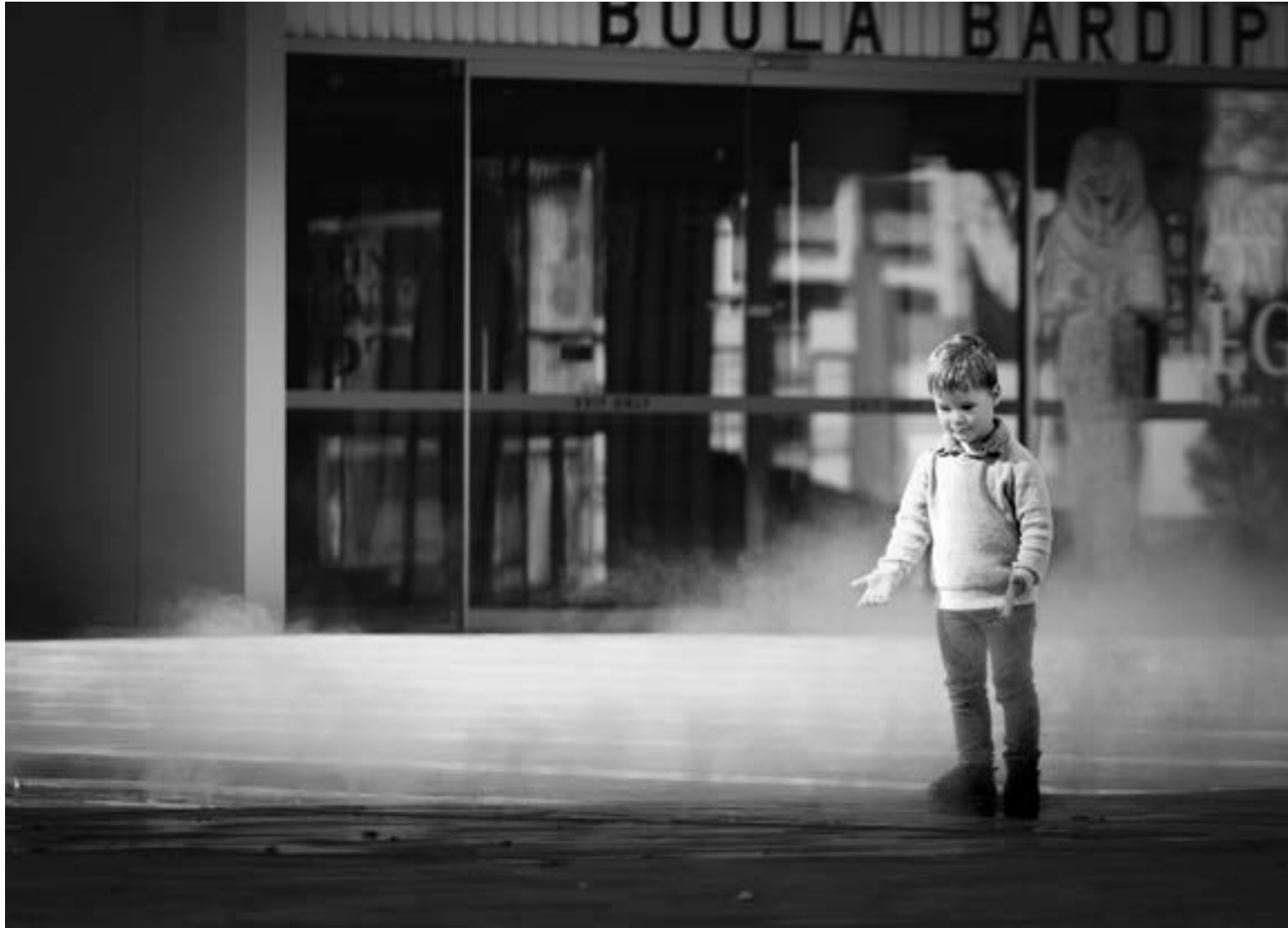
There are different ways to see our environment