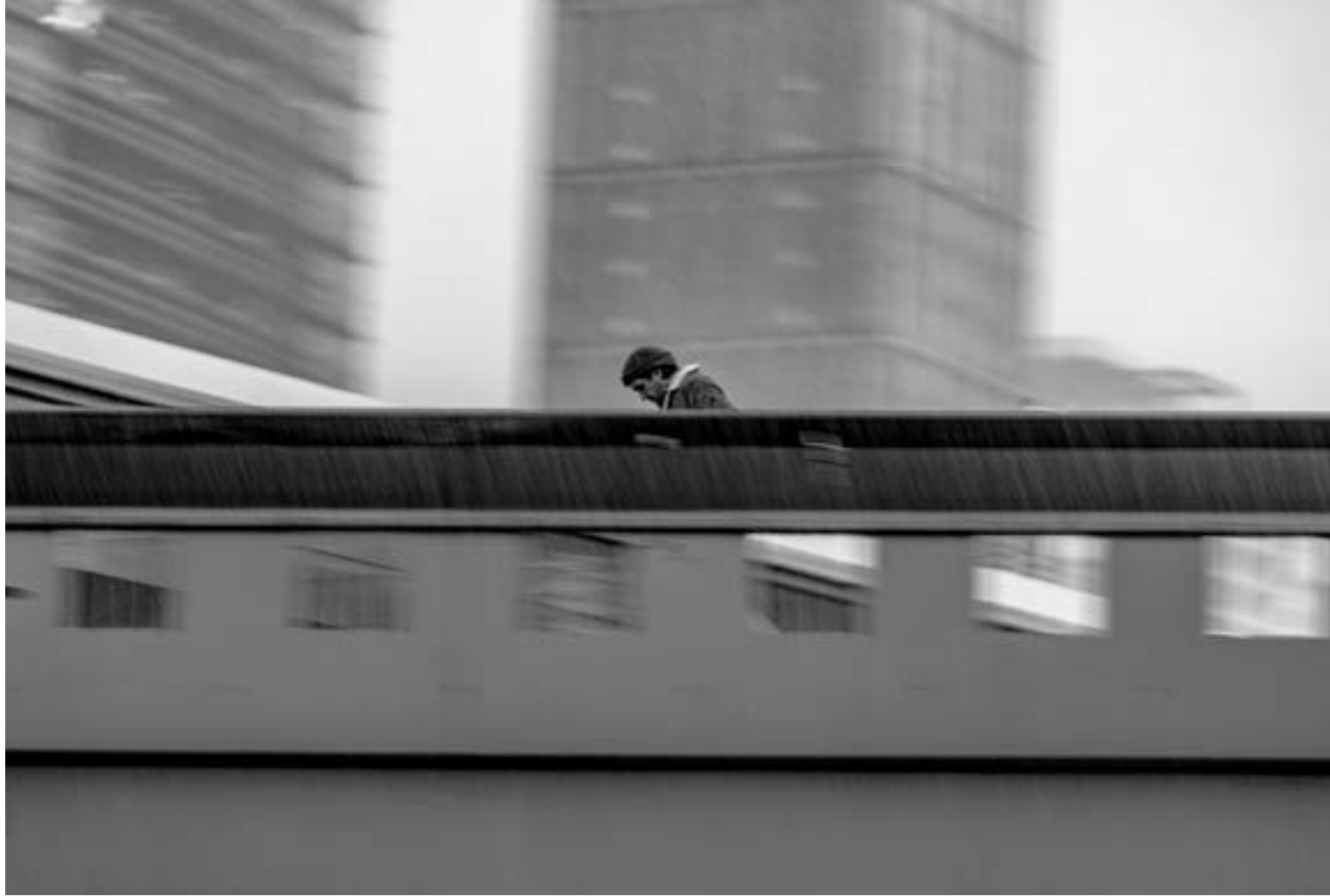
There are different ways to face our grey days