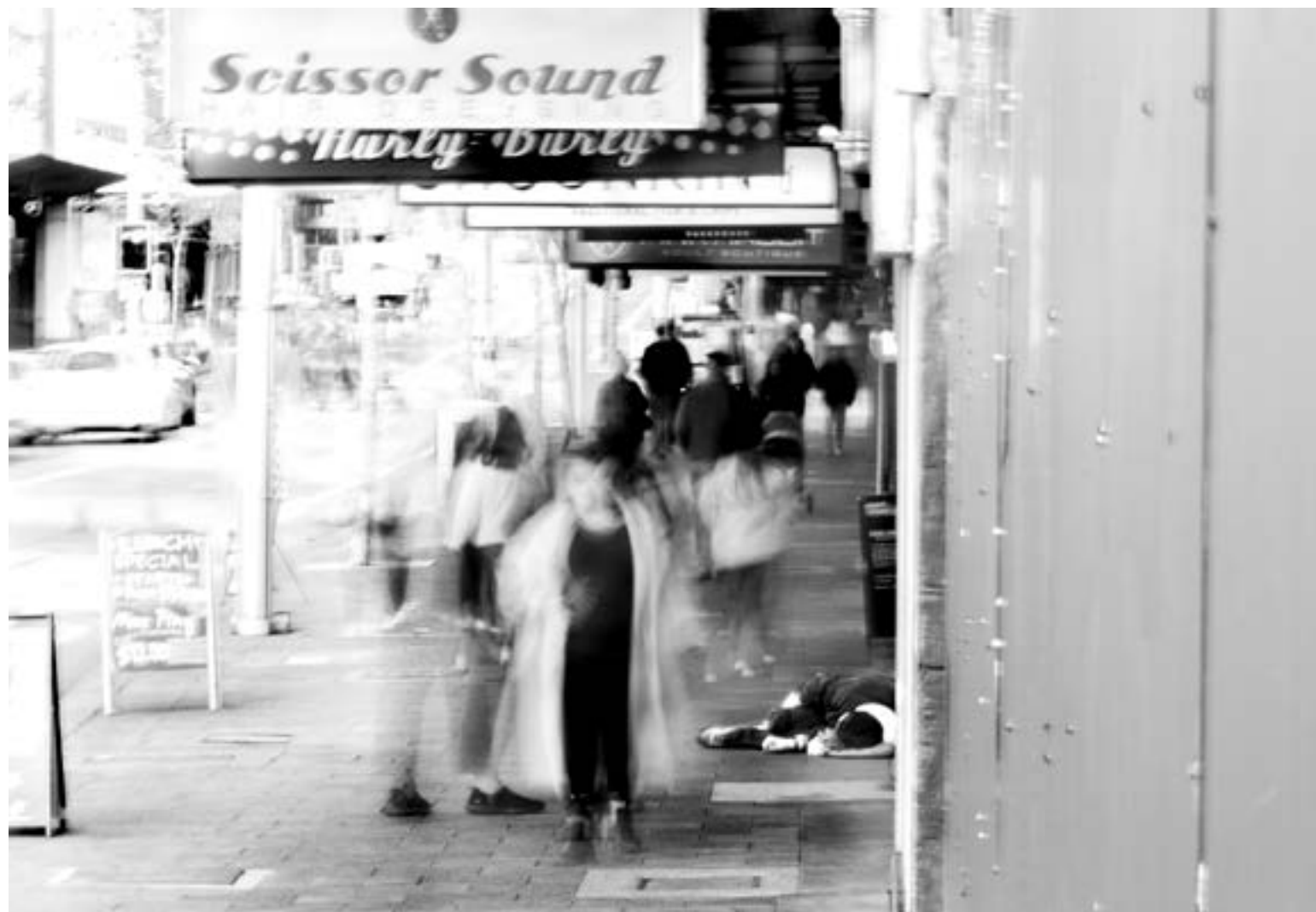
There are different ways to perceive the reality of the street