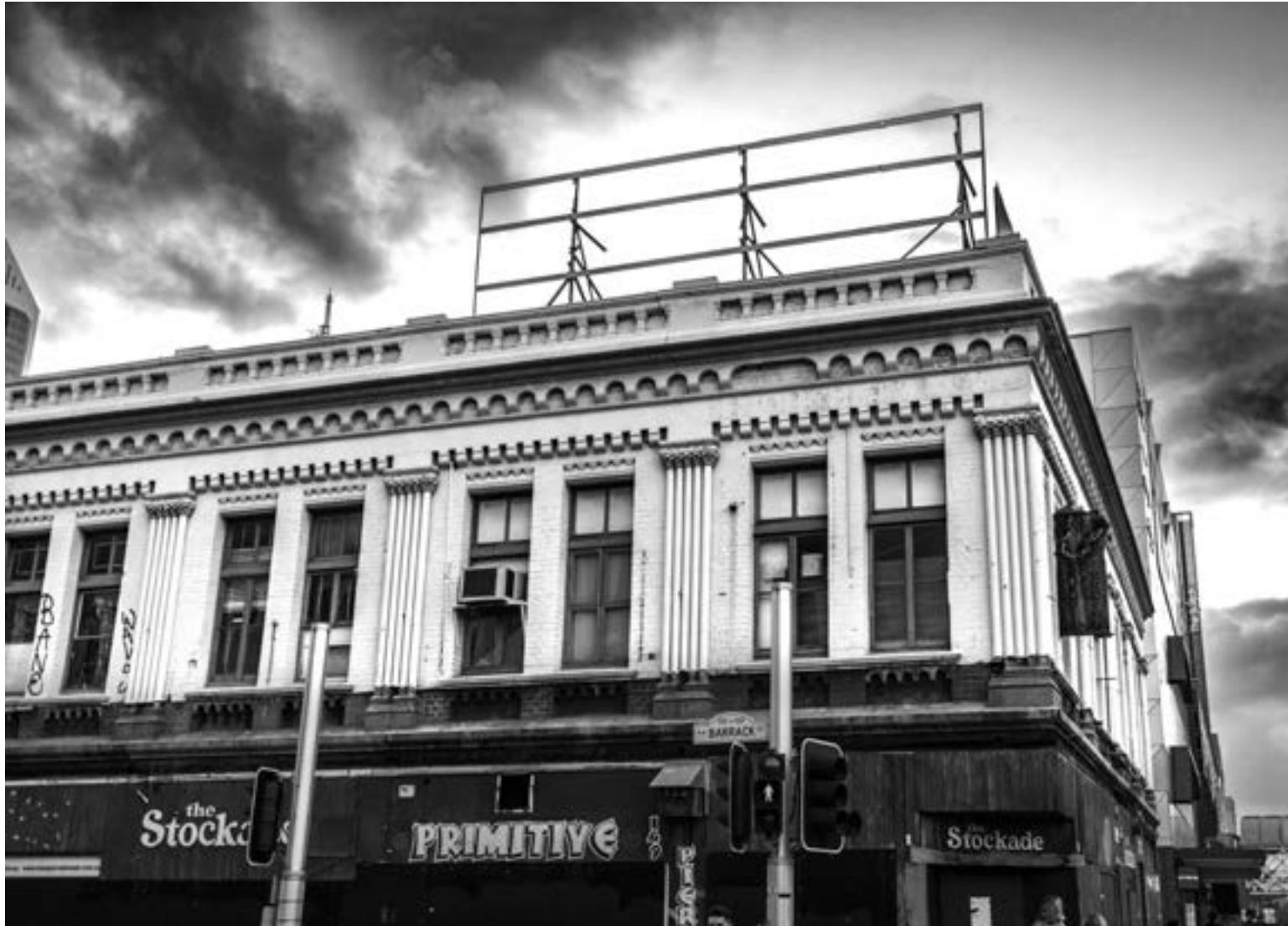
There are different ways of building