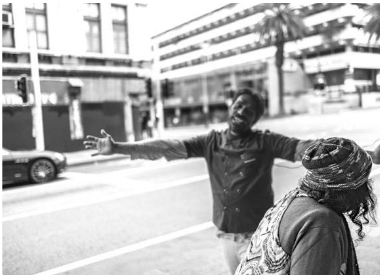
There are different ways of facing loneliness