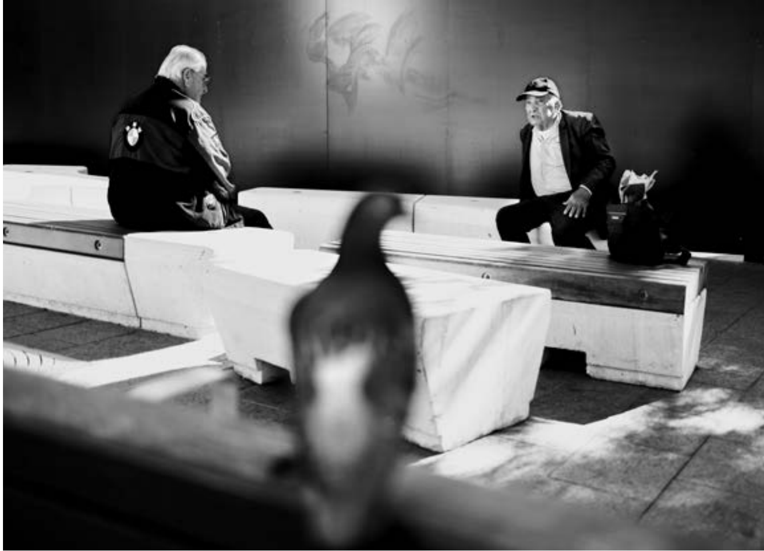
There are different ways of looking at the passage of time