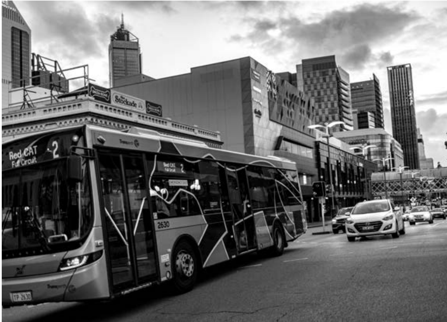
There are different ways of understanding what development is