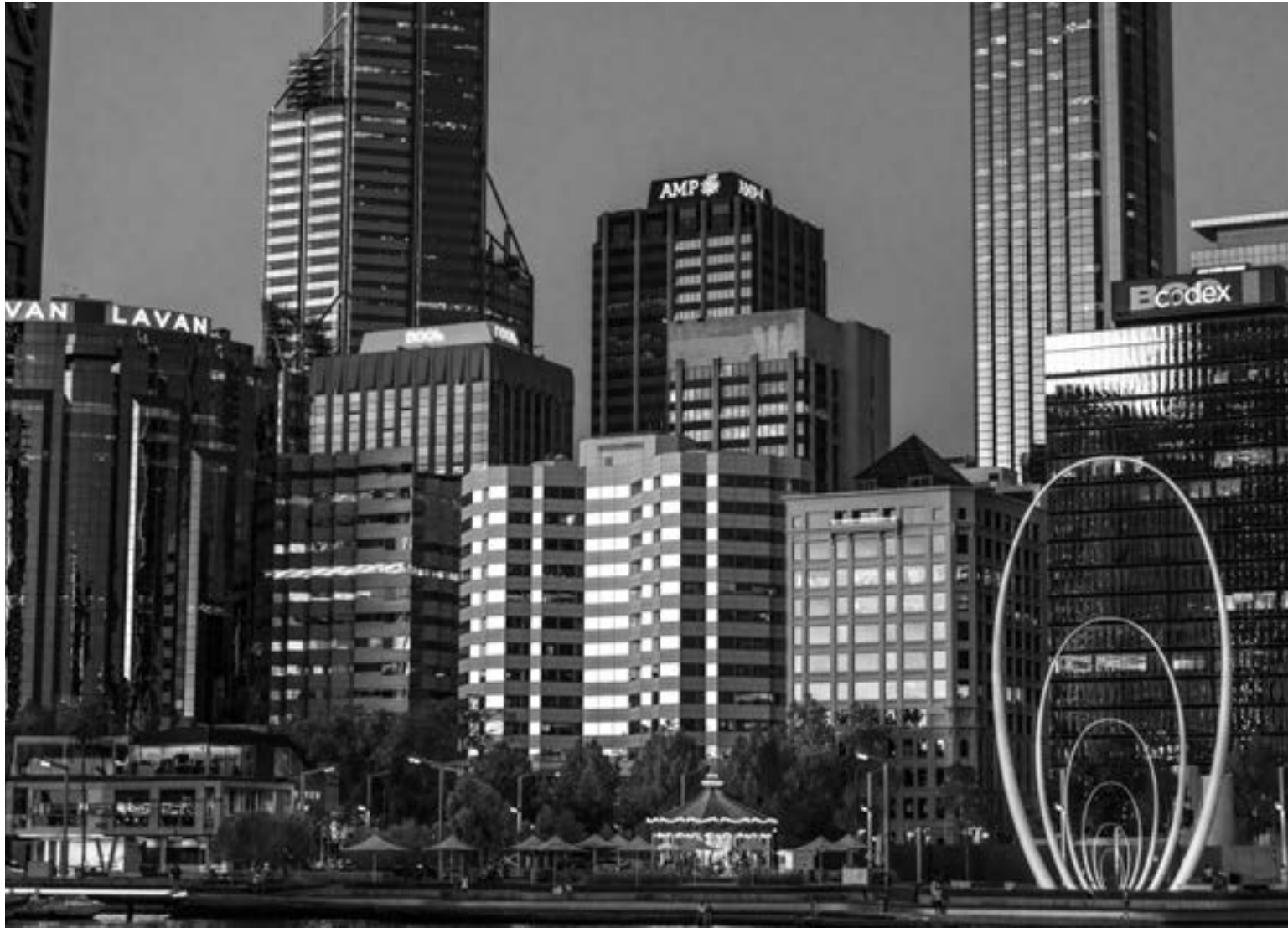
There are different ways to see a territory