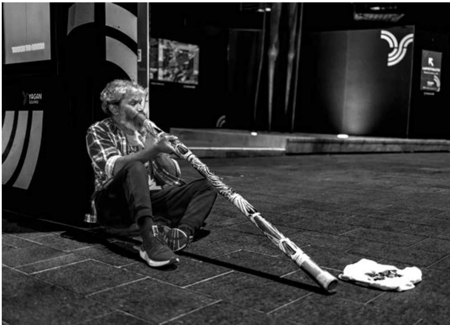
There are different ways of culture