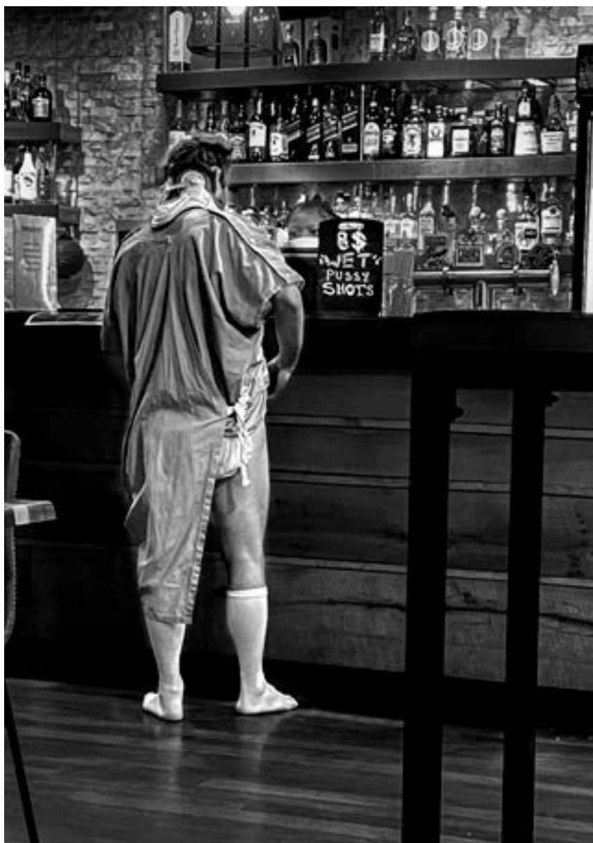
There are different ways to break the rules