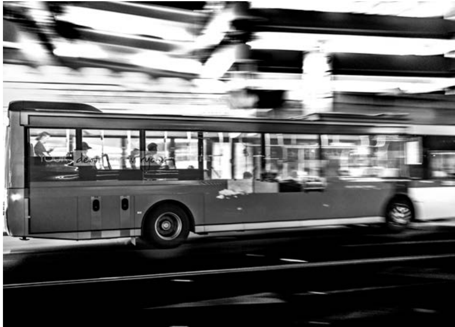
There are different ways to see the night