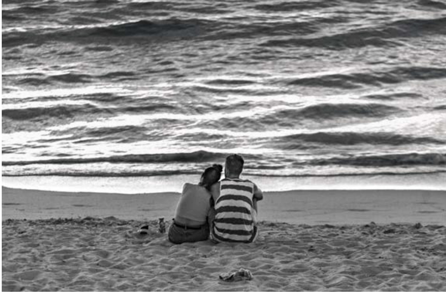
There are different ways of love