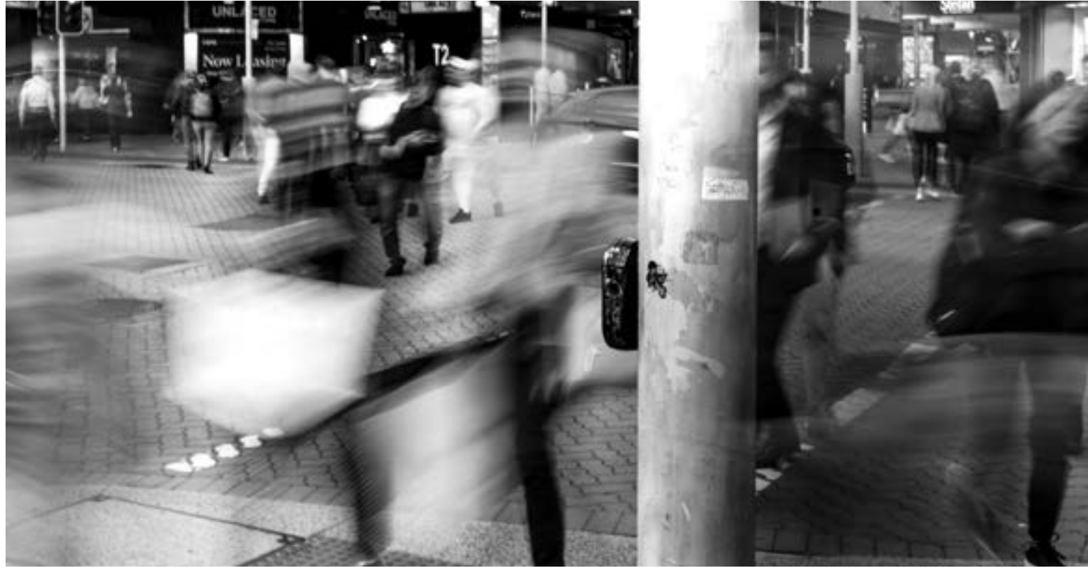
There are different ways of traffic