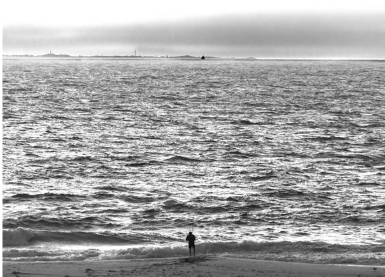
There are different ways to enjoy the beach