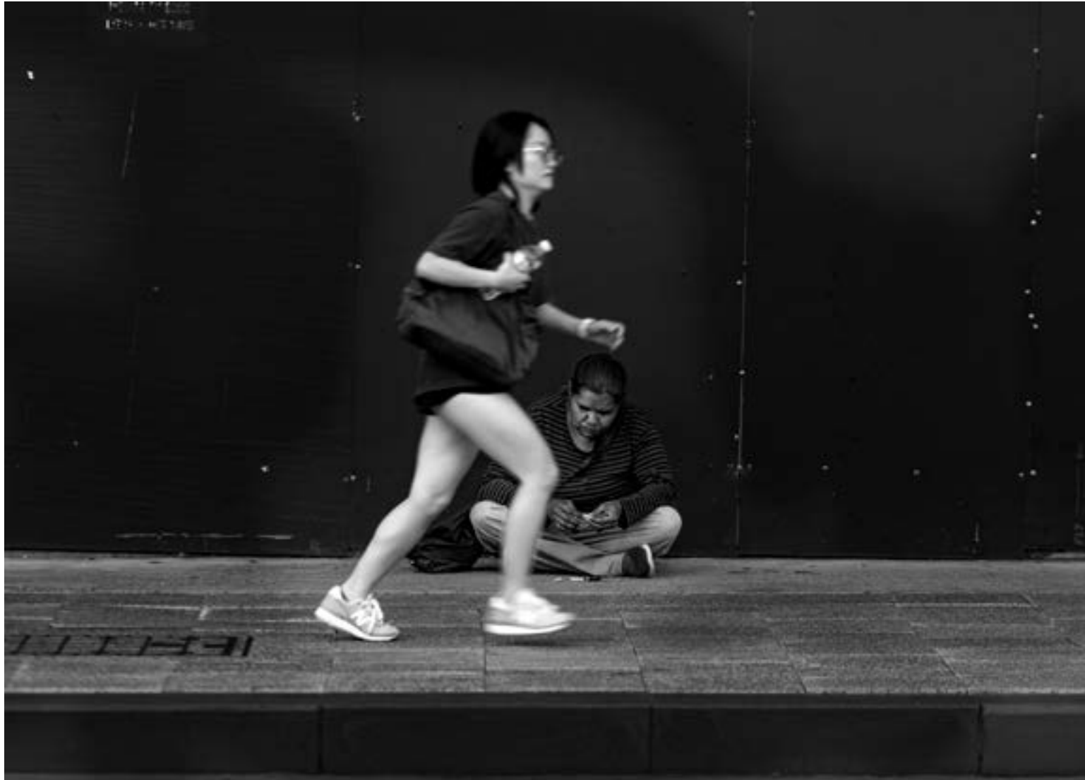
There are different ways to move through the day