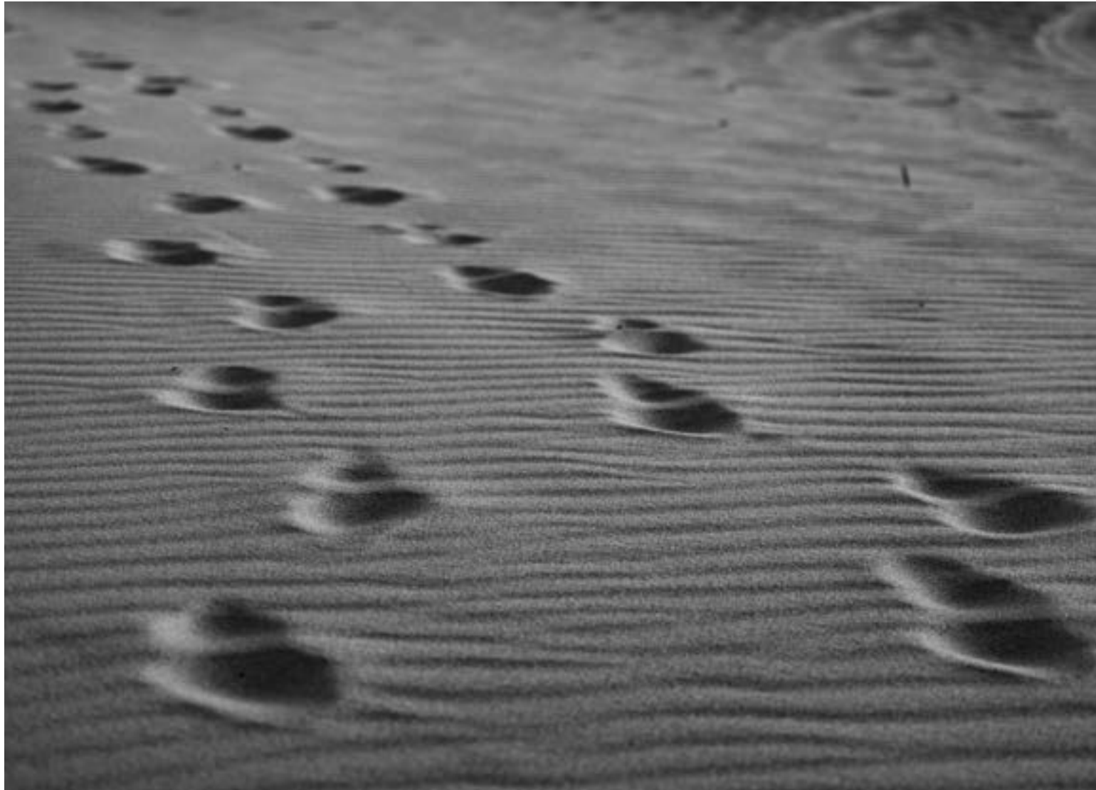
There are different ways to leave a footprint