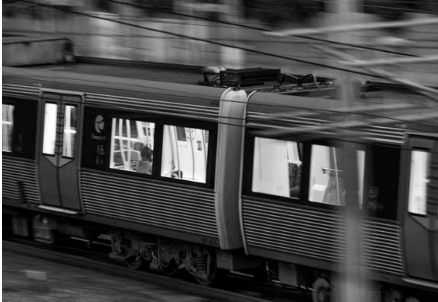
There are different ways to transport bodies